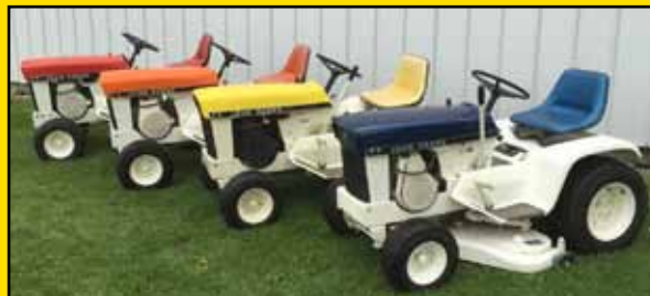
Feature Lawn & Garden Tractor John Deere Model 110 Patio