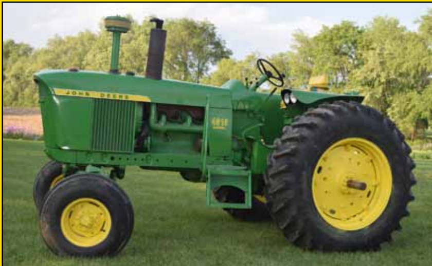
Feature Tractor John Deere Model 4010

Safety is the responsibility of everyone. Let's have a safe and enjoyable show!